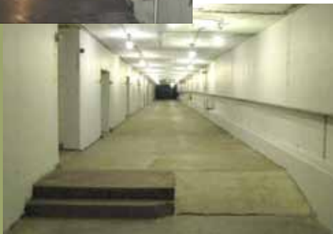
Corridor: Before and After