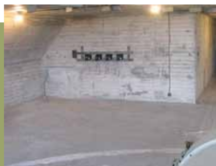
4 phones in the South Gun Room