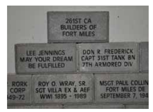
Wall of Honor paver display

The Wall of Honor (WOH) paver program is in full speed ahead! A total of 150 pavers have been purchased to date. Each engraved paver will be prominently displayed in Battery 519, America's first WWII Museum at an actual military site. The cost of each paver is $200.00 and is tax deductible. The fourth WOH ceremony will be held at 3 PM on April 28, 2012.