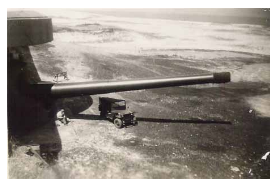
The only photo of Battery Smith known to exist.

If you have been following our progress in the local press, you know that we achieved our goal of raising the necessary money for moving the battleship Missouri barrel #371 (middle barrel of turret one) from outside Norfolk Naval Base (St. Juliens Annex) to Fort Miles. For those not up on the story, it has always been part of our Fort Miles Strategic Plan to have a 16" gun at our gun park (we had two here during WWII in Battery Smith behind the Biden Center) and we have worked for years to be able to secure one of the 116 ton/66" long monsters for DE! But we had