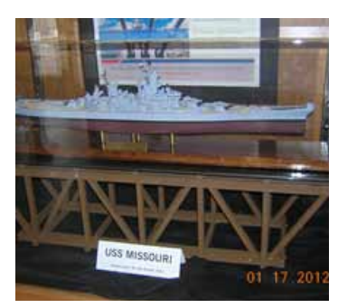
Lewes library display publicizing the 16" USS Missouri gun

The FMHA Publicity Committee completed its third display in the Lewes library. This recent display was to publicize the 16" Missouri gun being brought to the Fort Miles location. The first two displays (one at the Lewes library and one in the Ocean View library) used the M1901A1 Azimuth instrument as a centerpiece. Wooden fire control towers, 3-inch shells and a model of the U-858 German submarine complemented the exhibit.