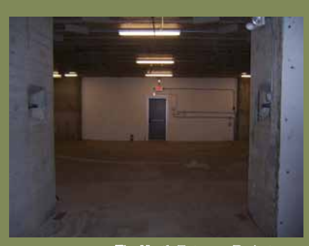
The North Entrance Project