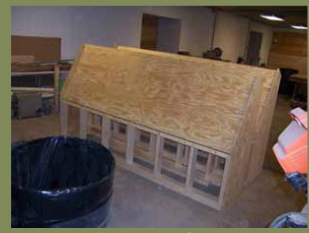
Missouri Paver Stand and another stand for regular pavers