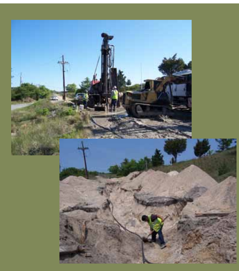
Digging wells and trenches for the Geothermal unit

concerted efforts of our volunteers, every dollar we spend generates about ten dollars worth of results. There aren, Äôt many bargains like this out there these days. As you can see, we make your donations count for as much as we can! Visitors are constantly amazed when they visit that our crew is 100% volunteers, and we're doing all this amazing work on a shoestring budget. So, keep those dollars coming, it's our desire to be as busy as we can, and this helps tremendously.