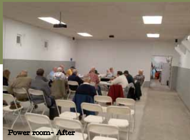
Power room- After