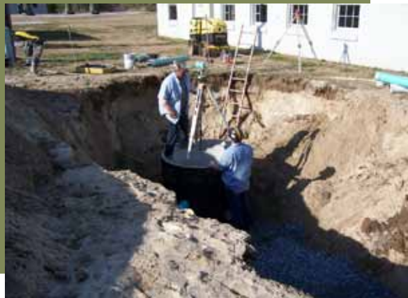
Updating the sewer system in the cantonment area