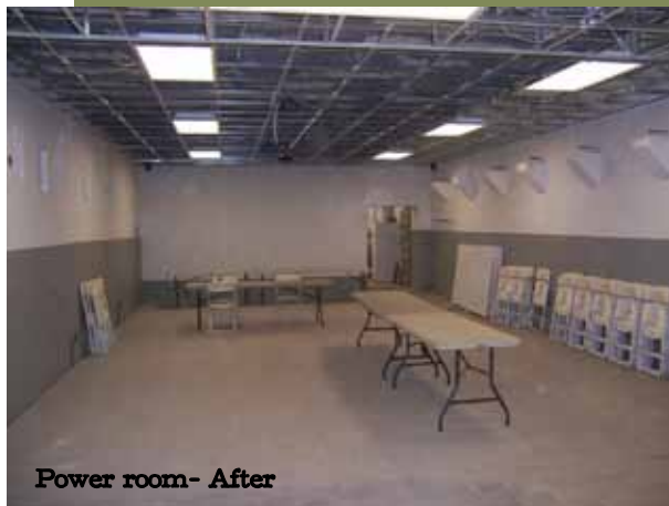
Power room- After