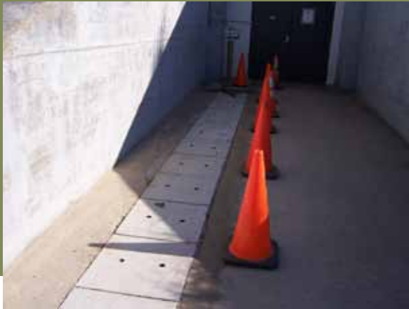
New concrete cable chase covers

this out there these days. As you can see, we make your donations count for as much as we can! Visitors are constantly amazed when they visit that our crew is 100% volunteers, and we're doing all this amazing work on a shoestring budget. So, keep those dollars coming, it's our desire to be as busy as we can, and this helps tremendously.