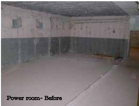
Power room- Before