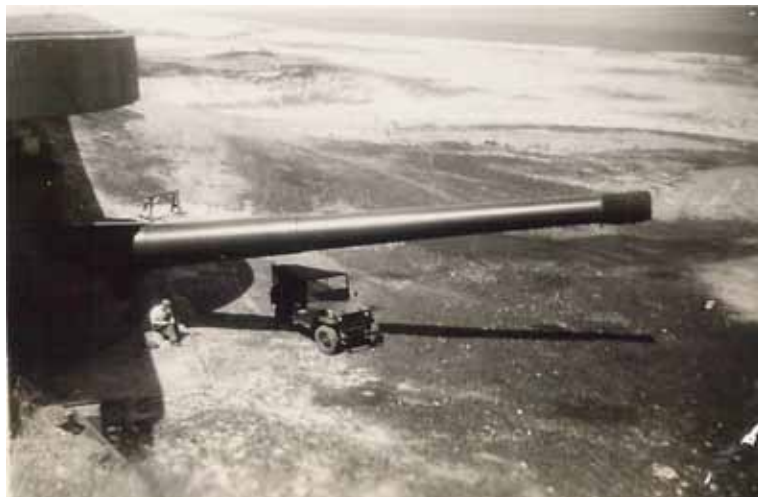
The only photo of Battery Smith known to exist.