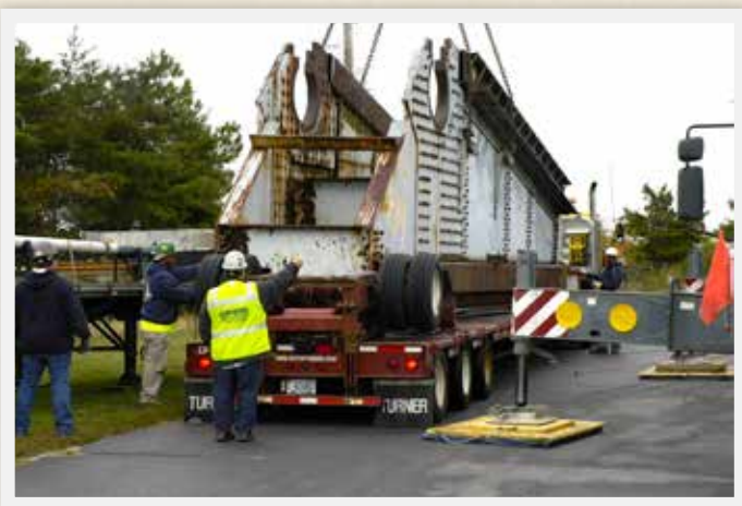
The 35-ton parts are maneuvered off a truck at Fort Miles.