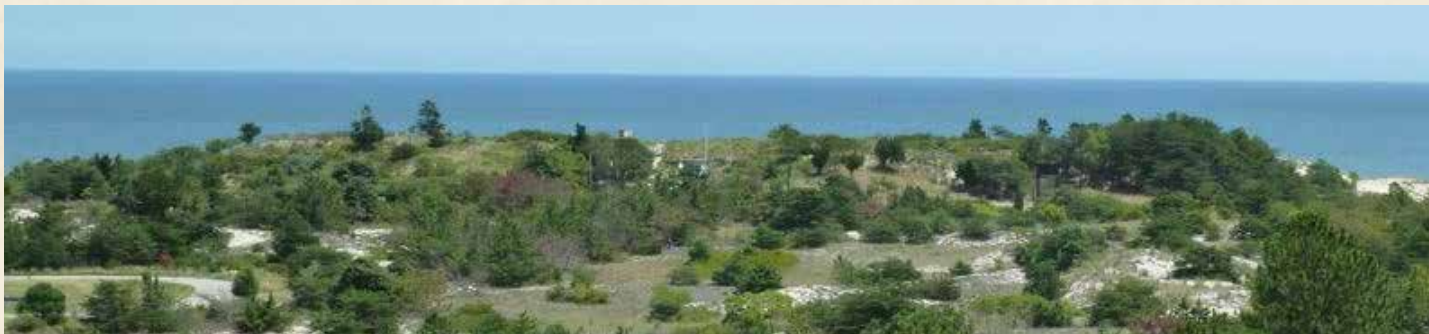
Battery 519 was a reinforced concrete 12-inch coastal gun battery. A view from the Observation Tower.

We have wrapped up another successful summer at Cape Henlopen State Park and Fort Miles and there are many things to reflect upon. We received some extra help in the Orientation Building and expanded tours. The Fort Miles Historical Association really helped to make the summer a success.