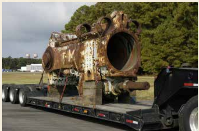
Pictures from left to right: The gift shop items being sold at the DE Goes to War event; a reenactment of German soldiers surrendering also at the same event; re-enactors demonstrating the plotting table; Gov. Markell's visit to Fort Miles; the gun parts at Dahlgren awaiting movement to Fort Miles.