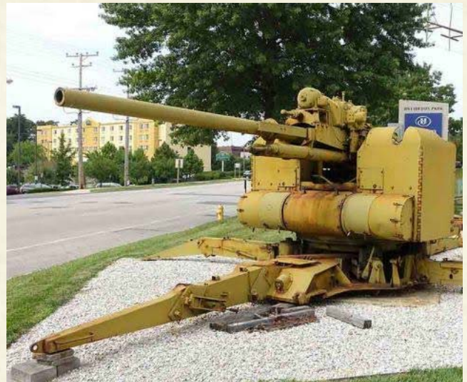
FMHA recently acquired a 90mm anti-aircraft gun, similar to those that protected Delaware River and Bay during World War II

After securing the largest (16-inch) in 2012, and moving it outside