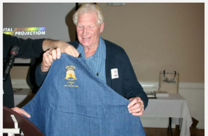
The fifth annual FMHA Awards Banquet was held Dec. 7 at Irish Eyes Pub & Restaurant in Lewes. The event is held annually to solute dedicated volunteers and supporters.