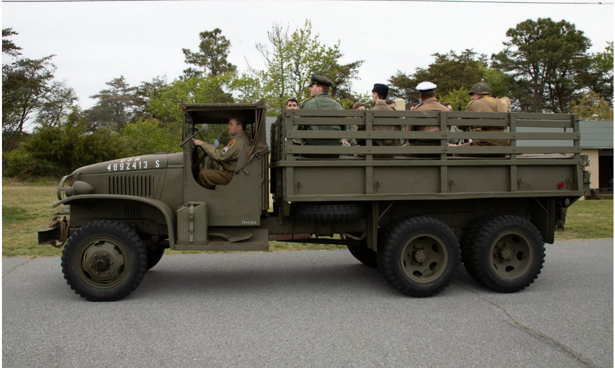
Part of the Submarine German Surrender Ceremony