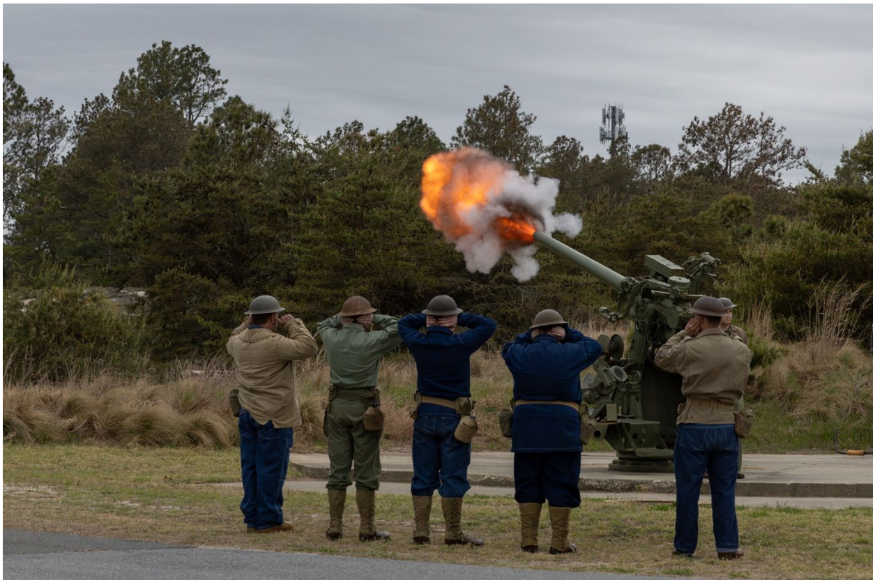
Of the 1000 people who came to the event, 271 toured the Museum, and over 100 attended the morning artillery demo and firing.