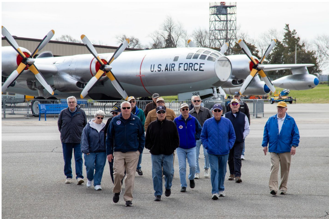
One of the Three Tour Groups at AMC